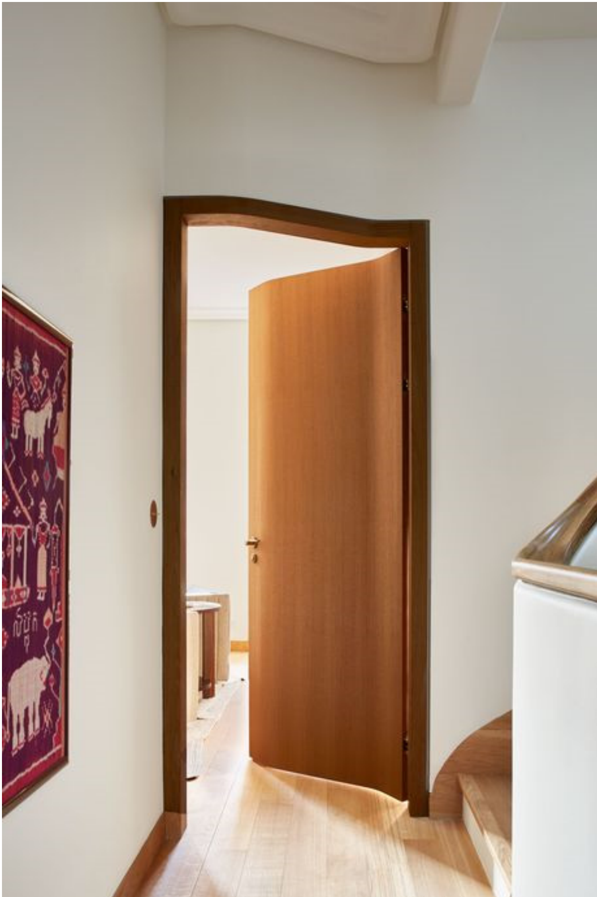
Door to Main Bedroom: Segers designed the S-curve door to accommodate the uneven wall space on either side of the opening owing to the design of his staircase. “I could have put the door on an angle, but then there wouldn’t be enough clearance space in front of the stairs, then I had the idea of using a double curve called the S-curve.” And in order not to reduce too much space in the bedroom, he moved the right wall.