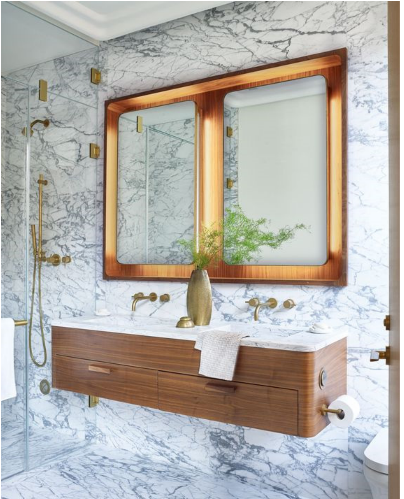
The Bathroom: Segers designed the bathroom with a cantilevered double-sink vanity and backlit mirrors that give the wood frames a golden glow.