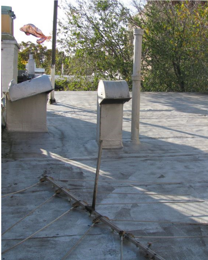
The Roof: Before: The tar-beach rooftop was cleared for a roof-deck. After: The grill covers the skylight for easy traversing but still lets in the light. The stairs were extended all the way up to the roof, replacing the former spindly vertical ladder, where you now end up in the wood structure on the left that opens to the roof-deck. From left: Photo: Cape AdvisorsPhoto: Tria Giovan