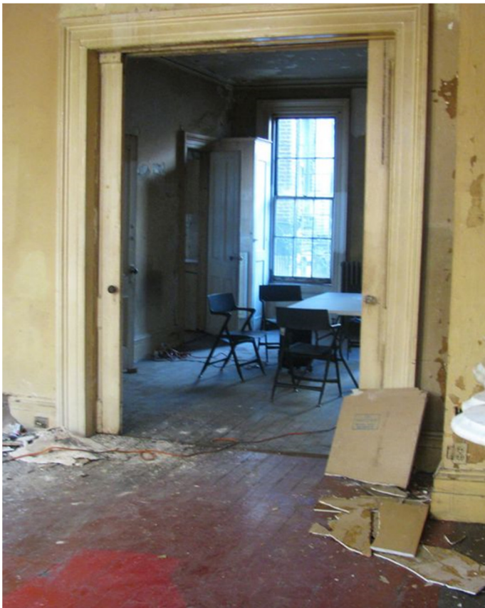
Upstairs Rooms: Before: The owner hadn't been living here for a decade. After: The open kitchen/dining/living room now has a terrace off the dining area. The fireplaces were refurbished with the original mantels when possible. The new floors are oakwood. From left: Photo: Cape Advisors Photo: Tria Giovan